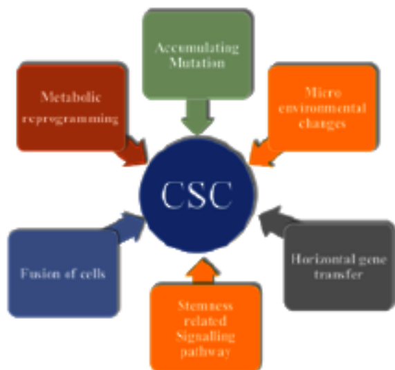
Fig. 1. Mechanisms which contributes in CSCs transformation.

The main mechanisms which give rise to CSCs are genomic instability, microenvironmental changes and gene transfer ( Fig. 1 ). In stem, progenitor, and differentiated cells, genomic instability is the fundamental basis of cell transformation, which leads to cancer initiation [20]. With having unlimited growth capacity, it is thought that stem cell transformation requires only a few genomic changes. More than 10% of gastric cancer identifies with low mutagenic change, which suggests this cancer originate from stem cell.