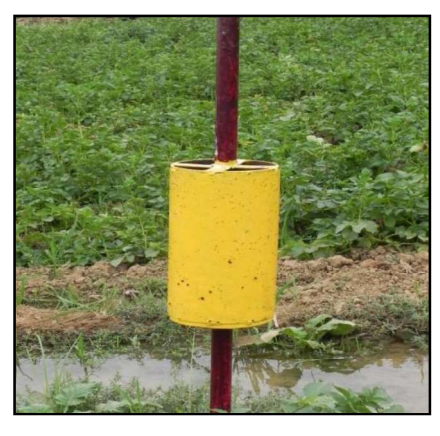
Yellow sticky trap

Two rectangular galvanized iron trays (45 cm x 30 cm x 10 cm), painted yellow on both the inner and outer sides, were used as yellow pan traps. Three-fourths of each pan or tray was filled with water, which was replaced every time just after taking the observation. These trays were kept in the potato field at a height of 15 cm above the ground but below the crop canopy. A few granules of phorate were always added as an insecticide in the water to kill the trapped insects to facilitate the correct counting of the leaves. The trapped aphids in both types of traps were collected every alternate day from December to March and the number was recorded periodically.