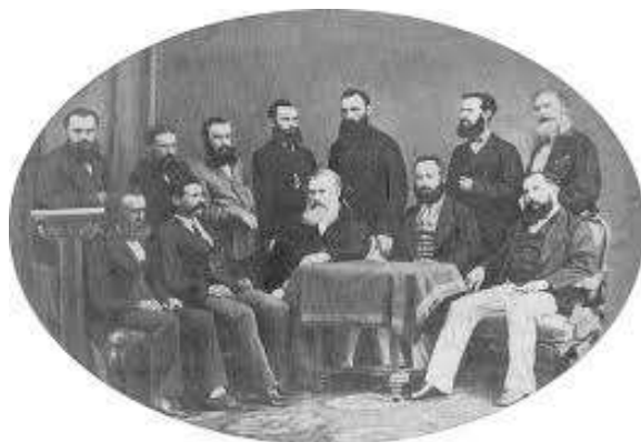
Fig. 4: First batch of geologist employed by GSI