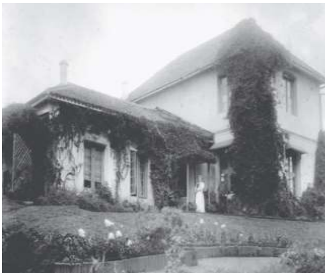
Fig. 2: View of Eva cottage at Yercaud